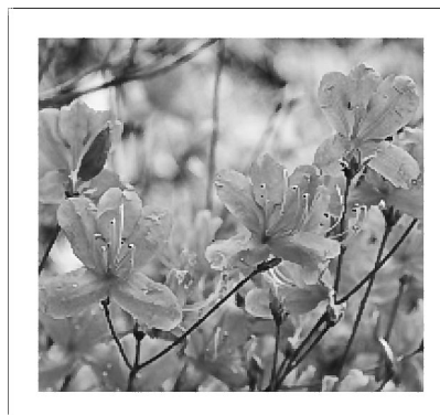
City Flower: Azalea ( Rhododendron Reticulatum D. Don)