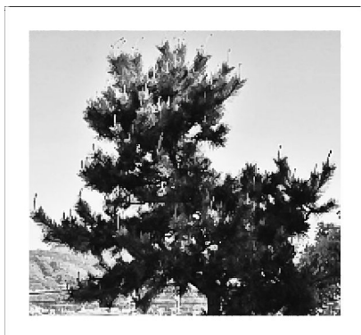
City Tree: Japanese Black Pine

As part of the celebration of the 30 th anniversary of the municipality, the Japanese Black Pine was chosen as the City Tree because of its superb shape and resistance to insects, and the Azalea ( Rhododendron Reticulatum D. Don) as the City Flower because of its beauty and abundance in the surrounding mountains.