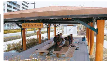
Genki Ashi-yu Footbath