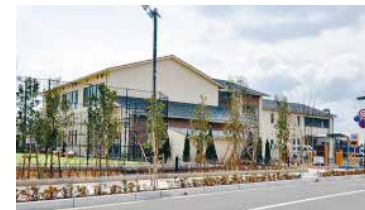
Shio-Ashiya Exchange Center