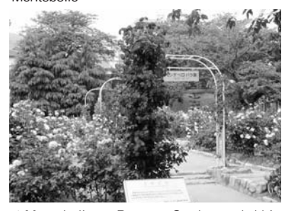
▲Montebello Rose Garden Iwagahira Park) - Opened in October 1973 to celebrate the Sister City Agreement. Location: 28 Iwazono-cho, ZIP 659-0013