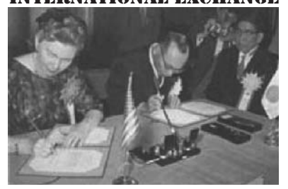
▲May 24, 1961 — signing ceremony of the Sister City Agreement in the auditorium of Seido Elementary School