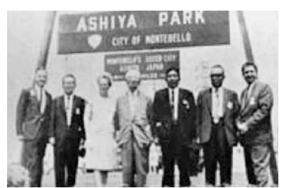
▲August 1972—completion of Ashiya Park in Montebello