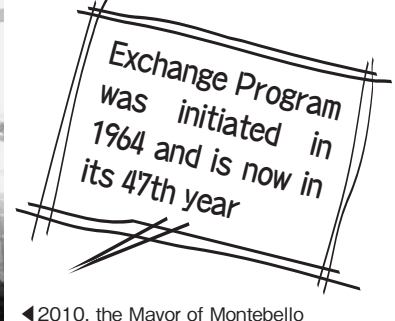
■2010, the Mayor of Montebello with the student ambassadors