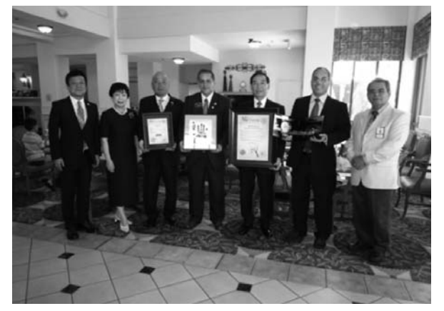
Meeting of officials from both cities - Exchange of gifts