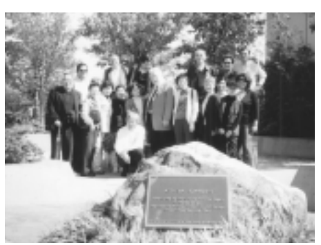
▲Members of the Citizens Visiting Delegation Ashiya-Montebello April 2006 at Ashiya Garden

Five years after establishing ties, Montebello began work on its "Ashiya Park", which was completed in 1972. In 2003 an "Ashiya Garden" was made on the grounds of Montebello City Hall. In 1973, Ashiya finished Iwagahira Park; it boasts "Heart's Desire" roses from Montebello, which grace the city with flowers every year. The same park have "Friendship Bell" and "Friendship Tree" (an elm), and is referred to fondly by the citizens of Ashiya as "Montebello Rose Park."