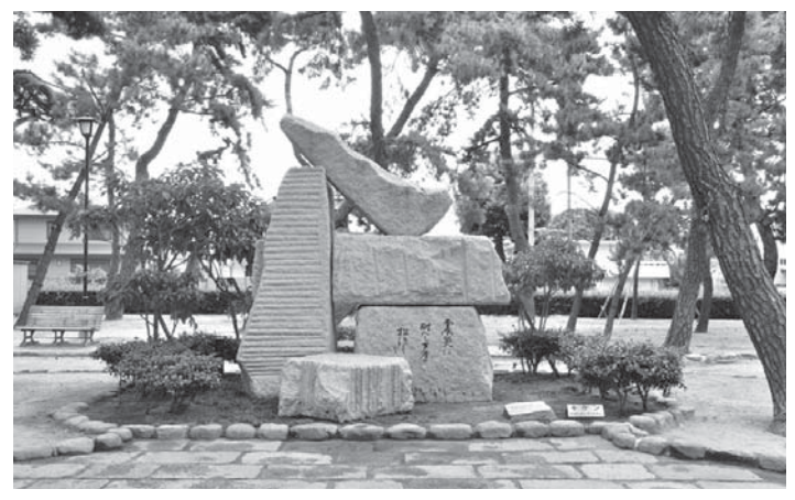
▲ Earthquake and Restoration Memorial (Ashiya Park)

* Other flowers and offerings will not be accepted * Please use public transportation, as parking is not available for cars or bikes.