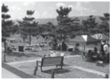
Shio-ashiya Barbecue Plaza (Minami-hama-cho)

To protect the living and natural environments of nearby areas, barbecuing and other similar events are prohibited south of Shiroyama Dam along Ashiyagawa River as well as on both sides of the Canal Park, as indicated in the right map. That is, any kind of gathering that requires fire cooking is banned.